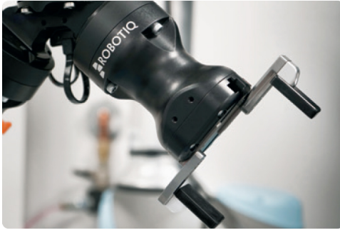
Extenders sold separately